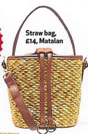
Straw bag, £14, Matalan