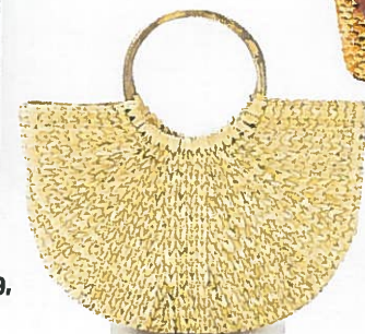
Straw tote (left), £28, Miss Selfridge