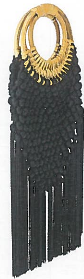
Tote bag, £29.99, Zara