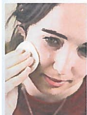
■ Lush Amazon primer naked facial oil, £9.95

In addition to the new shop, Lush's plastic packaging-free products are also available online, and the brand recently made its Naked skincare range permanent because of its popularity with fans. If you're looking for a sustainable alternative to face wipes, try the reusable and biodegradable 7 to 3 Cleansing Wipes.