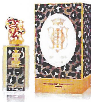
Sisley Eau du Soir Tiger Walk Limited Edition Eau de Parfum 100ml £184.

Dr. Bronner's Whole Kernel Organic Virgin Coconut Oil is the first coconut oil on the UK market to use the whole kernel of the coconut, making it virtually waste-free in its production. £8.99 for 440ml.