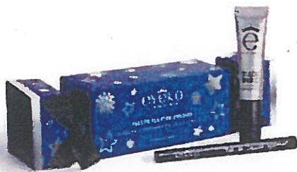
Eyeko Christmas Cracker (worth £19) £15 eyeko.co.uk

Beyond Powder , Illamasqua's emblematic baked highlighting powder, now comes in two – limited-edition skin finishes – Adding a subtle, healthy glow to skin thanks to its silky powder texture. £34 Available at illamasqua.com and in stores.