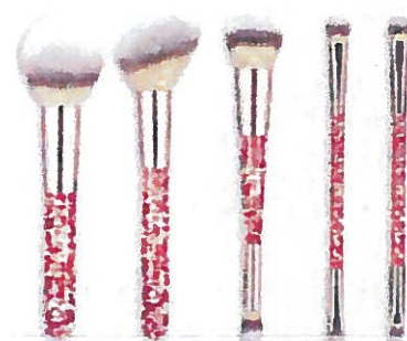
IT Cosmetics Your Luxurious Must-Haves Brush Set £120 Selfridges

The Elemental palette from Illamasqua has 12 universal powder eyeshadows that work for both day and night, with 12 intense colours to suit any skin tone. Also includes limited edition packaging. £38 Available at illamasqua.com and in stores.